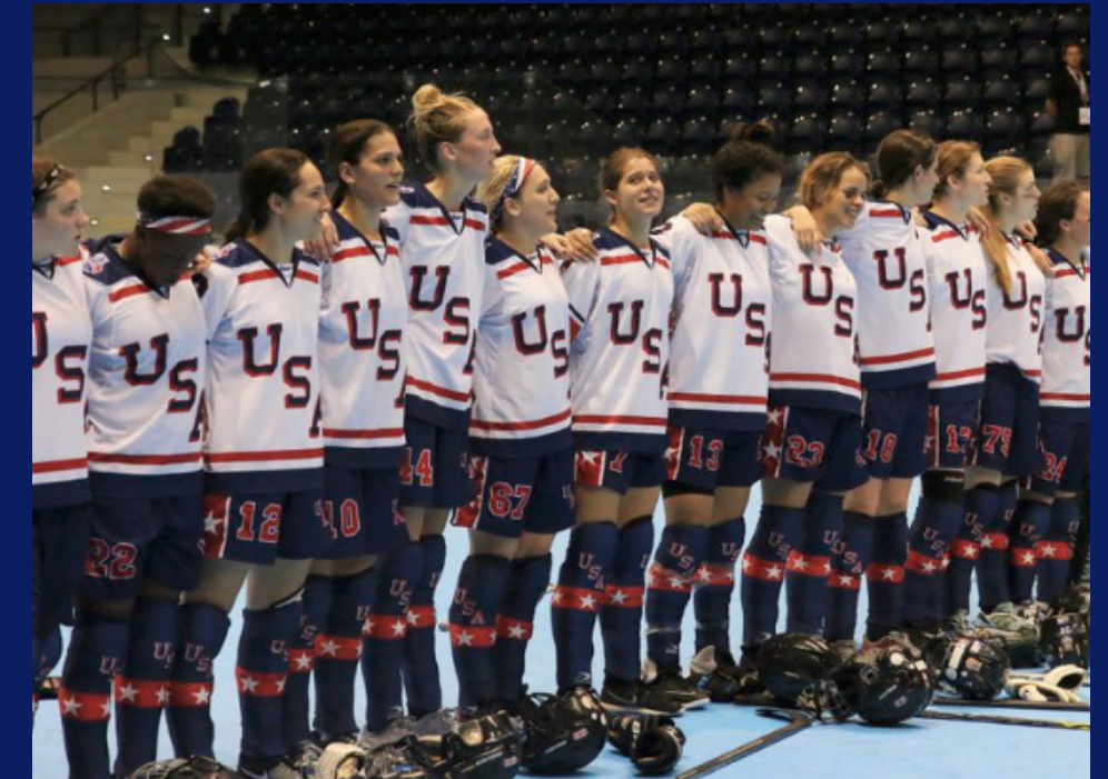
SUPPORT OUR PLAYERS