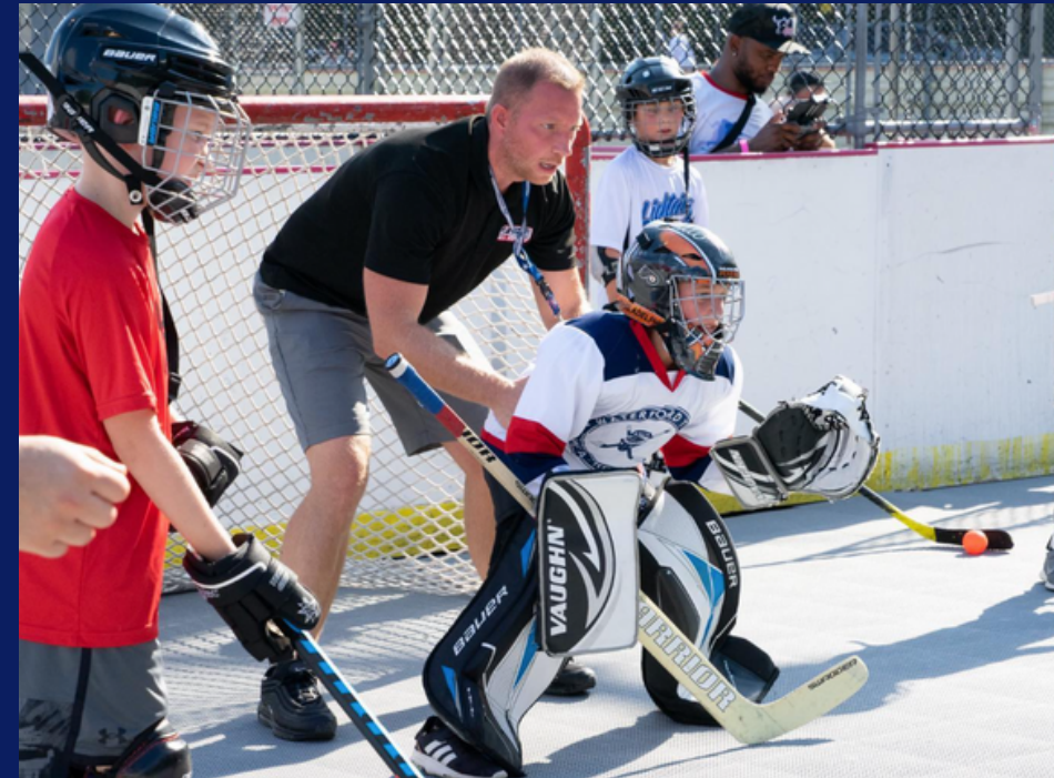
GROW THE GAME